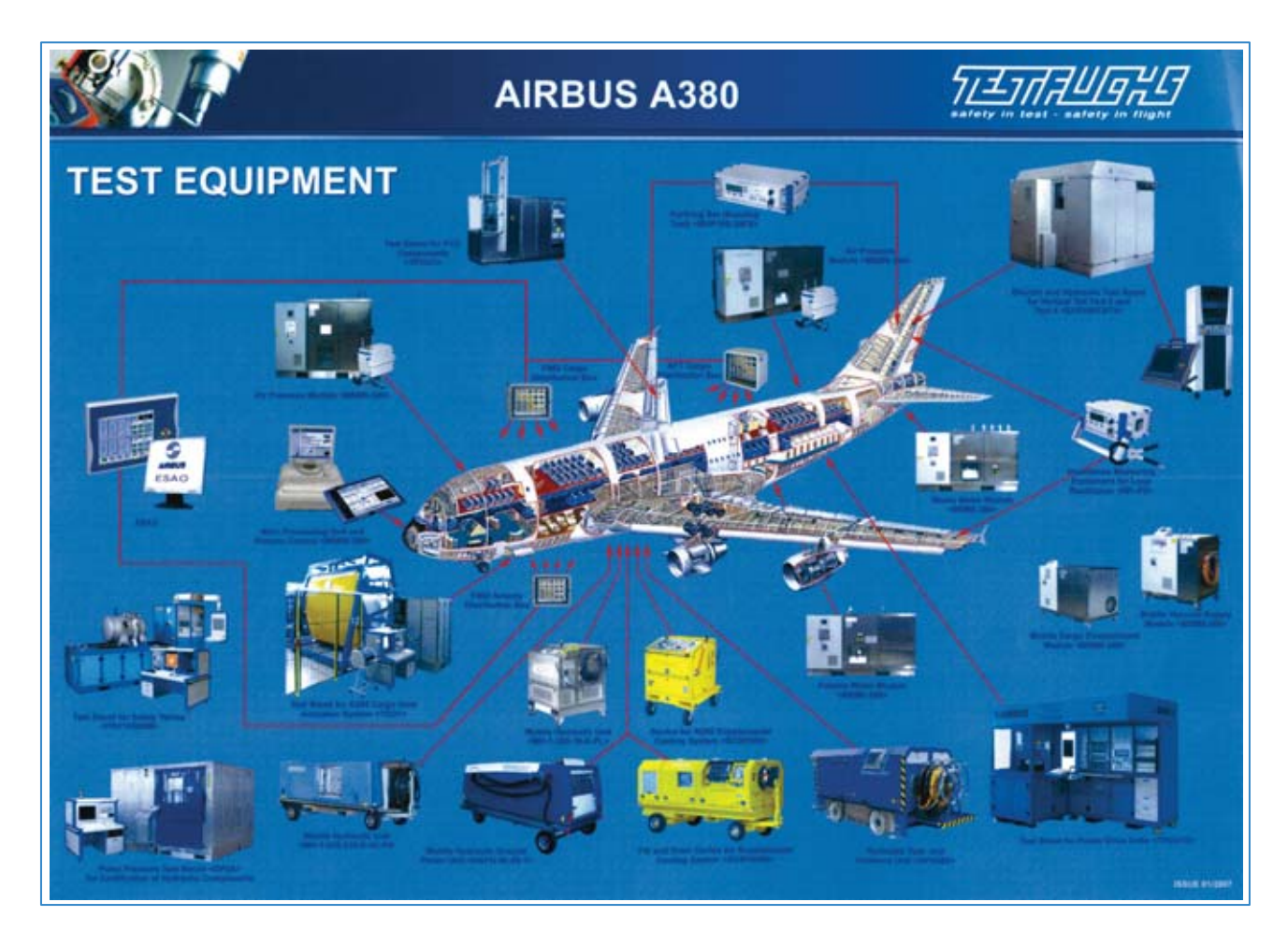
Fig. 1. Ground diagnostic and provision equipment for A-380 (drawing from the original A-380 Manual)

technology we can follow the entire process of service steps in space (3D) and time environment. Fig. 2 shows exemplary verification of some service steps on a forward aircraft undercarriage.