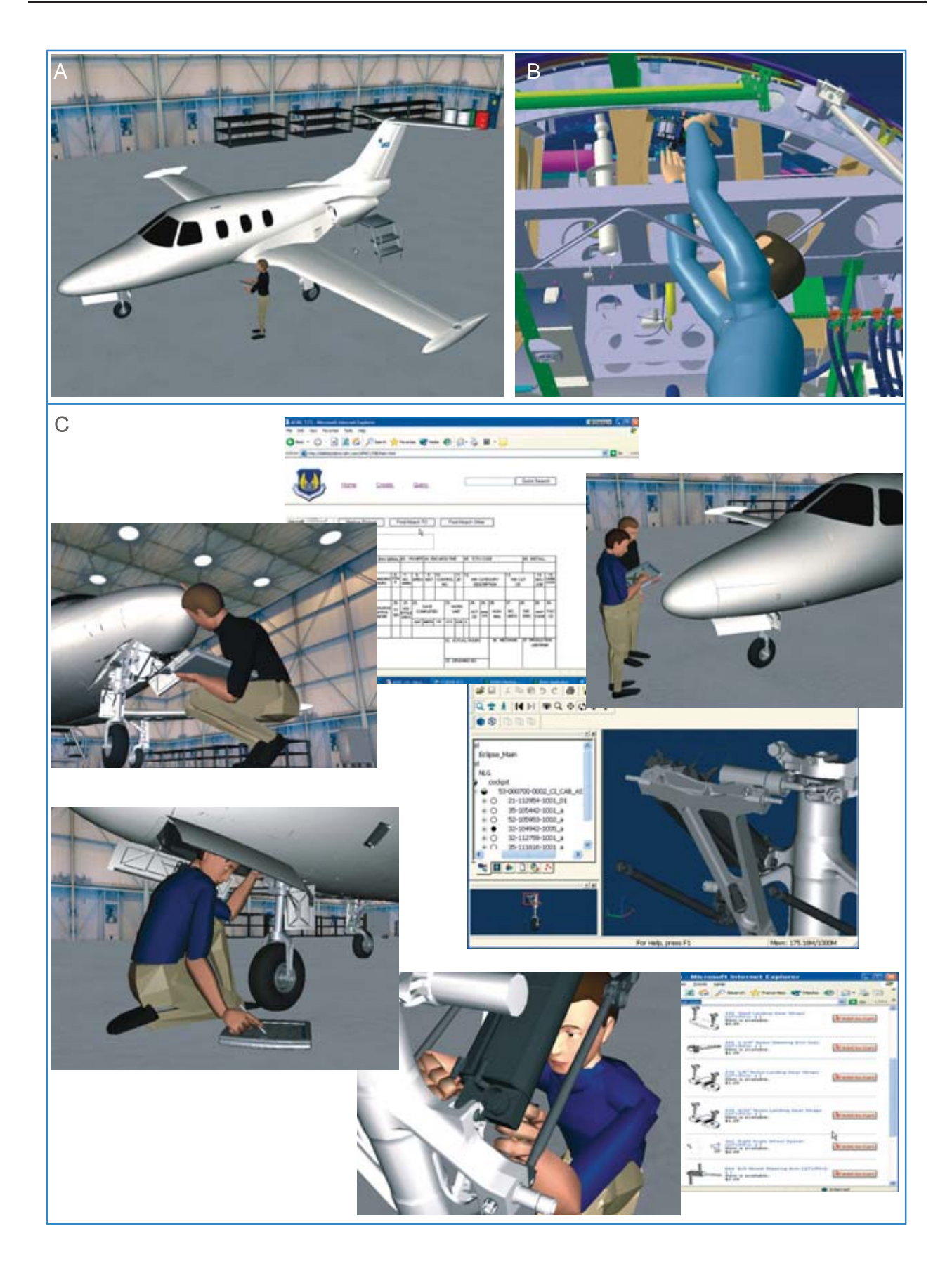
Fig. 2. Computer aided verification of an inspection of a front undercarriage (B) of an aircraft (A) and service of the B-787 aircraft (C).